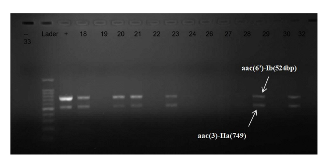
Figure 1. Aminoglycoside resistance genes, aac(3)-IIa (749) bp and aac(6')-Ib(524 bp).

The results revealed that the aac(3)-IIa gene was present in 50% of the hospital wastewater samples, while aac(6')-Ib was observed in 42% of the samples. The studied genes were found in 28% of the urban wastewater samples. In-