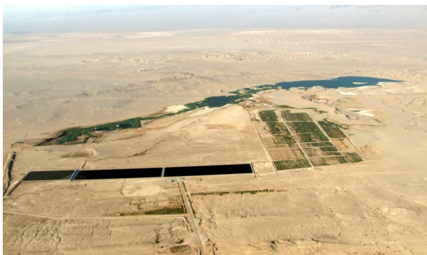
Figure 1. Overview of treatment plant

This was a descriptive cross-sectional study carried out during 6 months including the cold-season months (from mid-January to mid-March) and warm-season months (from mid-May to early August in 2010-2011). The warm and cold months of the year were determined through the weather data of the previous years, and it was done upon natural treatment system (artificial wetland). In this research, some composite samples were taken, carried to the laboratory, and measured according to the standard methods in order to determine nutrients parameters in different points of the existing treating plant systems. From Yazd artificial wetland treatment system series, 4 beds were selected randomly. One bed did not have plants, and was used as the control bed, but the other three beds had reeds. All beds were designed with the same physical and hydraulic conditions. One bed was randomly chosen out of the beds with common reeds as the representative